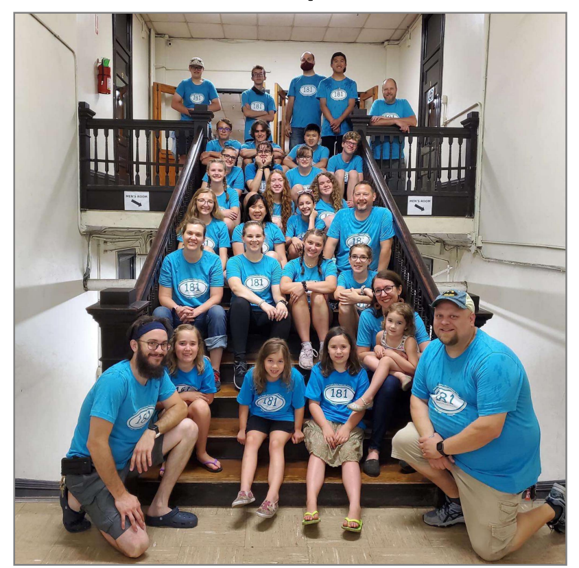
OneEightyOne student ministries of the Parma Heights Baptist Church from Parma Heights, Ohio during their work week at Horizon Central.

The hot and humid weather did not deter them from their physical and demanding work, and there was not one complaint uttered despite the difficulty of their tasks. They came and demonstrated their love and dedication by undertaking tasks of grounds-