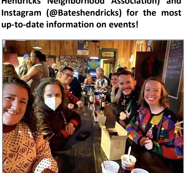
Residents show off their festive sweaters and sing karaoke at Bauhaus Tap

As always, follow our Facebook (Bates-Hendricks Neighborhood Association) and up-to-date information on events!