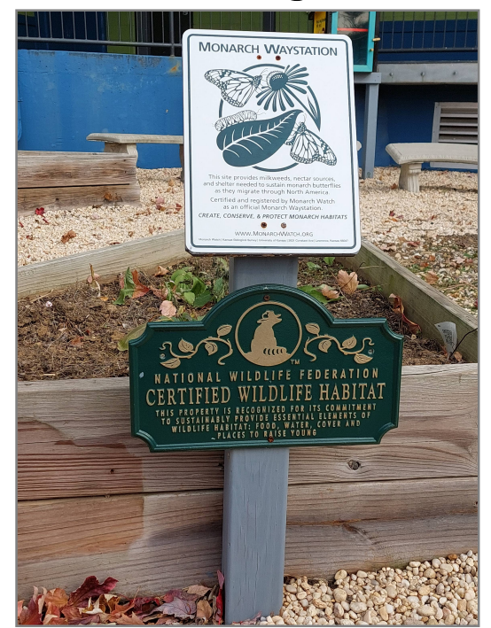
These signs indicate part of the programming SENSE Charter School significantly supports. They aim to serve as champions for sustainability to help our neighborhood be a healthier place to live, learn, and grow.

SENSE Charter School was again honored to be selected as a recipient for the Indiana Thriving Schools Challenge program. This is the fourth year SENSE has been selected for the highest class in the Masters Category. This was in recognition for the school's many accomplishments activating green programming at the school.